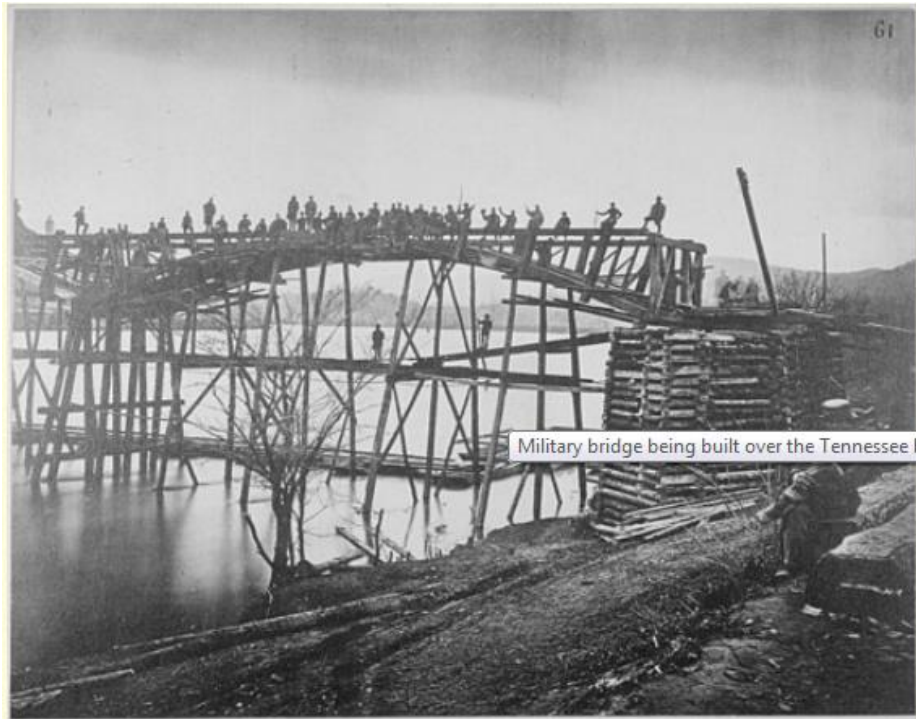
Military bridge constructed over the Tennessee River, 1863

The man who was engaged in being hanged was apparently about thirty-five years of age. He was a civilian, if one might judge from his habit, which was that of a planter. His features were good--a straight nose, firm mouth, broad forehead, from which his long, dark hair was combed straight back, falling behind his ears to the collar of his well-fitting frock coat. He wore a mustache and pointed beard, but no whiskers; his eyes were large and dark gray, and had a kindly expression which one would hardly have expected in one whose neck was in the hemp. Evidently this was no vulgar assassin. The liberal military code makes provision for hanging many kinds of persons, and gentlemen are not excluded.