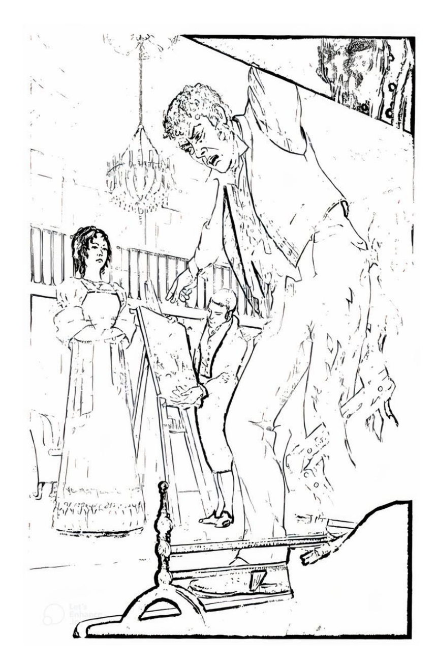
'Take away this easel and the picture on it!'