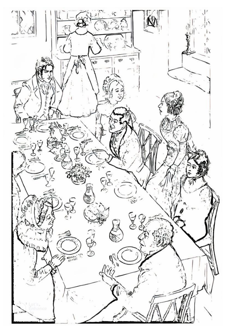
'Everyone knows that Mrs Graham has a bad character.'

Suddenly I heard voices. Everyone had come out of the house and they were walking in the garden. I hoped that no one would find me. But a few seconds later, 1 saw someone coming down the path. It was Mrs Graham! Why was she alone? Were our other guests refusing to speak to her? I stood up as she came towards me.