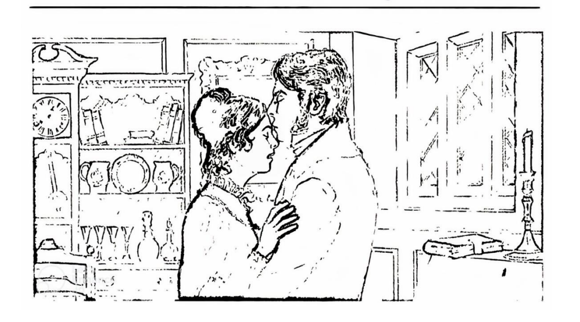
'Go, go!' she whispered at last.

I held her for a moment more. Then I left her.